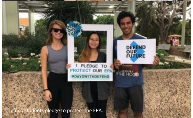
Defend students pledge to protect the EPA.