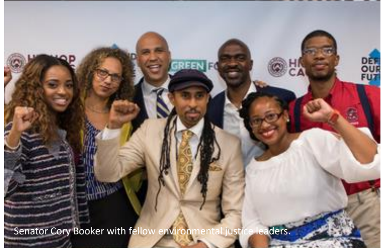
Senator Cory Booker with fellow environmental justice leaders.