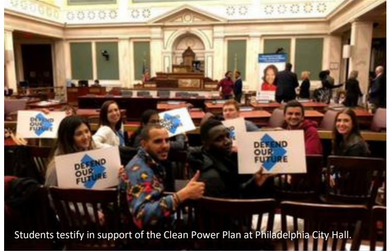
Students testify in support of the Clean Power Plan at Philadelphia City Hall.