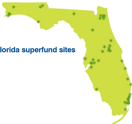
Florida superfund sites

In Hillsborough County, where 25 percent of the residents are Latino and 17 percent are